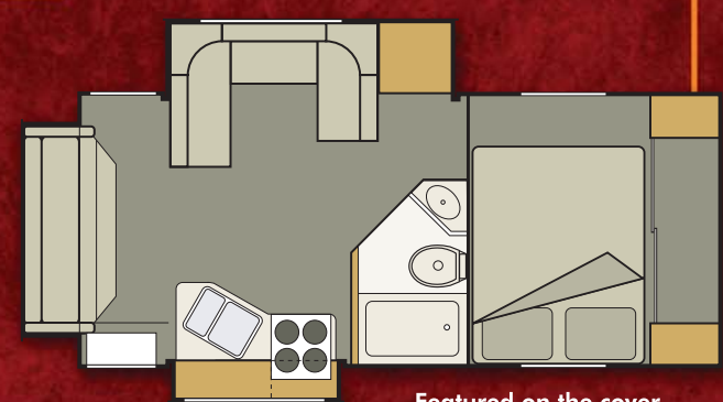
Featured on the cover

The HOST Everest is truly the ultimate truck camper. When you step inside this TRIPLE slide-out camper, you will be amazed at the large living space. It's hard to believe that you are in the bed of a pickup truck. This camper offers lots of storage, a large bathroom with a tub/shower combo, separated bedroom area, and most of all plenty of room to kick back with family and friends.